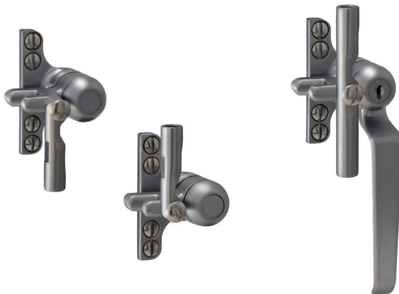
B646NOSEOI & 2 Connectors