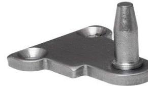
T375TRP03 – Rest Pin