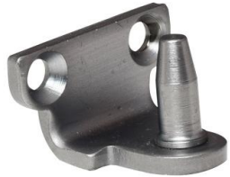
T37PIN07 – Pin Bracket