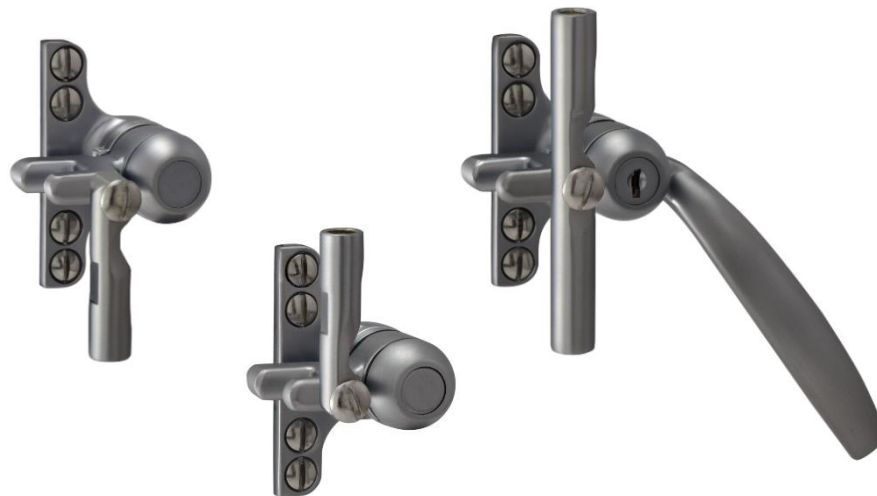
B646NOSEOI & 2 Connectors